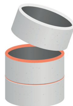
Bonding of precast concrete units